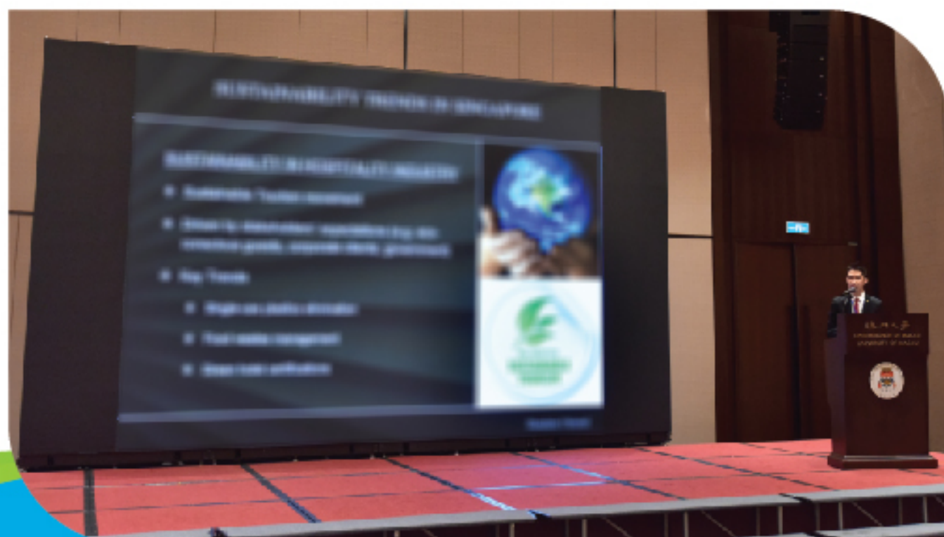
Sharing the sustainability trend of a tourism destination 分享一個旅遊目的地的可持續發展趨勢