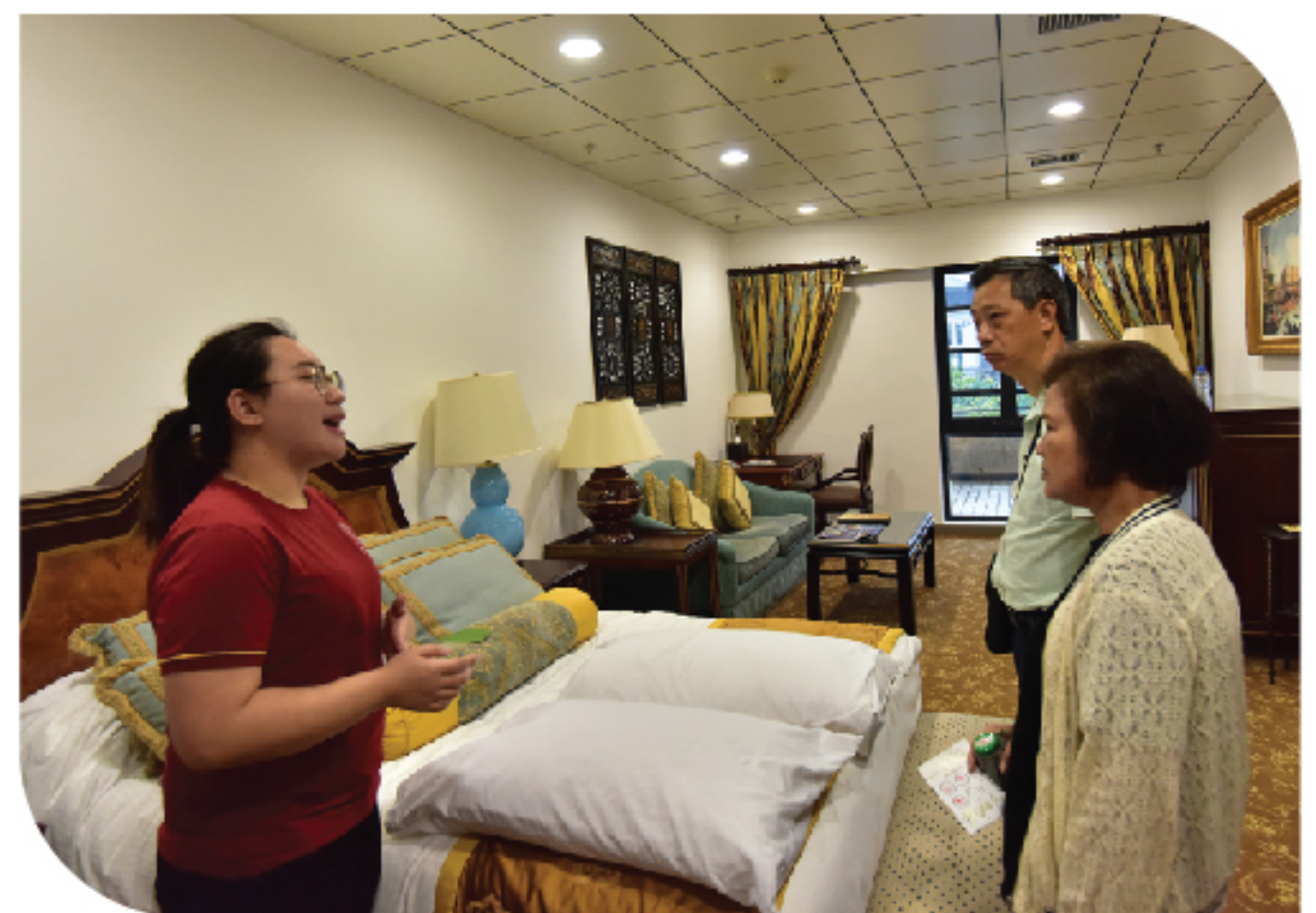
Experience housekeeping service offering in a mock hotel room 於模擬酒店客房內體驗客房部工作