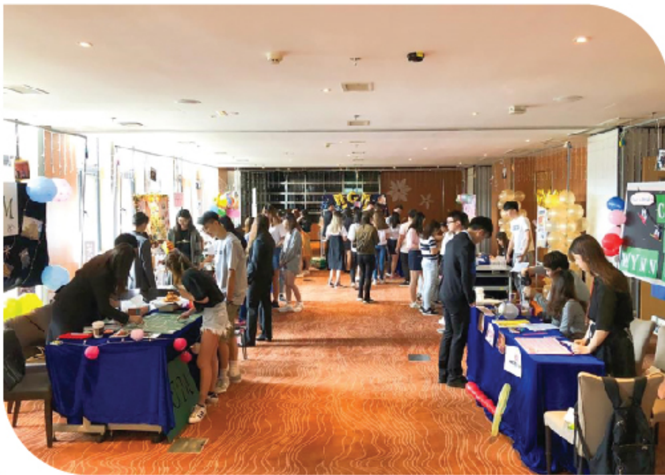
Experience customer service offering in a hospitality lab 於款客實驗室內體驗款待客人

參加者可以親身體驗綜合度假村內不同前線部門，包括前堂、客房部、禮賓部、會議展覽、餐飲和博彩等主要部門的運作。