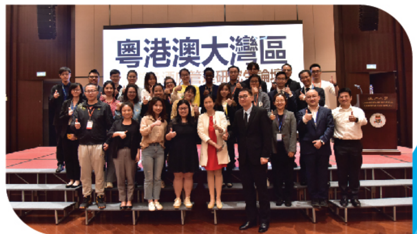
Forum for Tourism and Hospitality Graduate Students in the Guangdong-Hong Kong-Macao Greater Bay Area 粵港澳大灣區旅遊及酒店管理研究生論壇