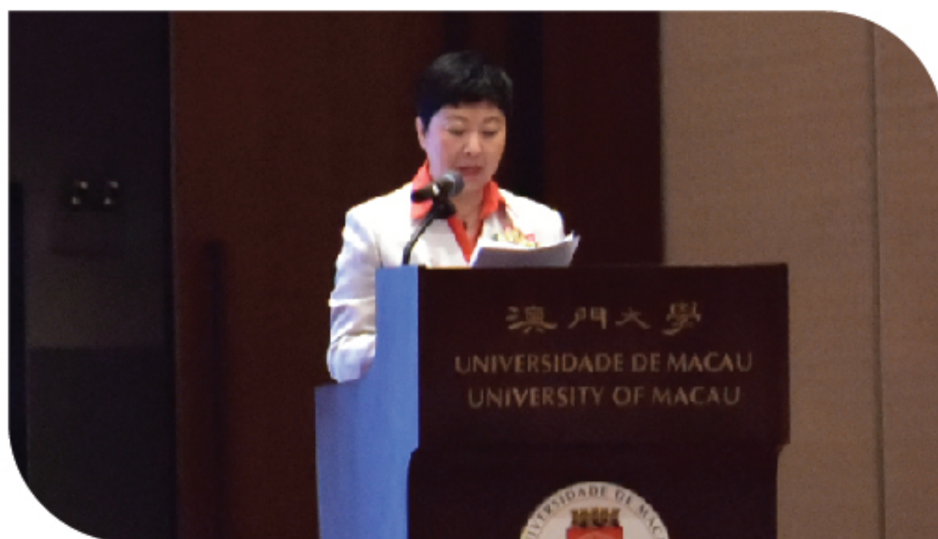
Forum on Sustainable Tourism and Hospitality Practice in the Guangdong-Hong Kong-Macao Greater Bay Area 粵港澳大灣區可持續旅遊及酒店管理論壇

來自新加坡、馬來西亞、上海、廈門，以及大灣區內的廣州、深圳、香港和澳門等城市的十六位知名學者和高管在論壇上就可持續旅遊和款客服務業的實踐作主題發言。這兩個論壇吸引了數百名來自十六所大學（包括教育工作者和學者）參與。中心亦專門為來自澳門和其他大灣區城市的研究生舉辦論壇，探討有助大灣區旅遊業和綜合度假村發展的構想和研究。由此，這些論壇起到了促進澳門作為大灣區各個城市與外界溝通的“橋樑”角色。