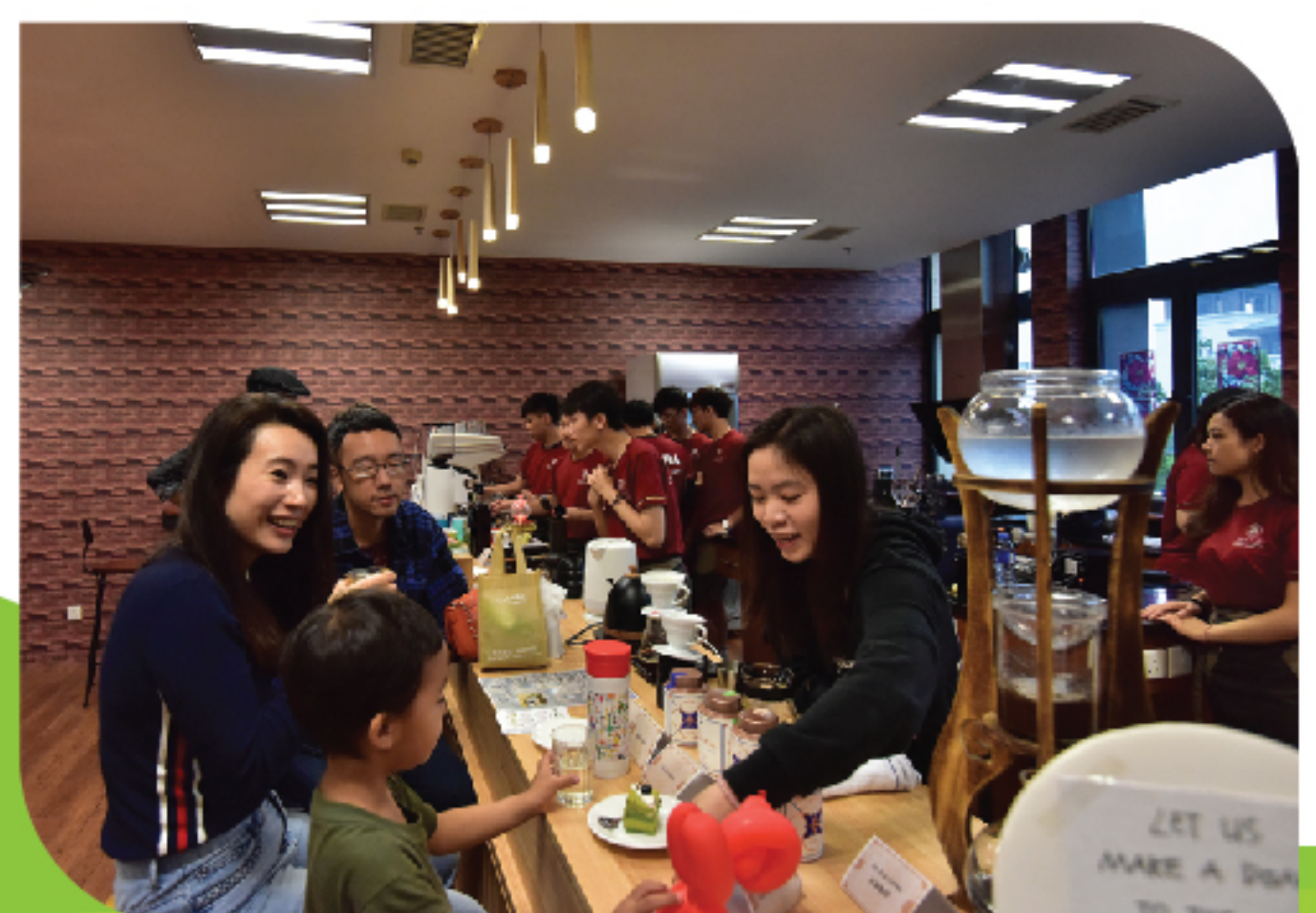
Experience catering service offering in a mock café 於模擬咖啡店內體驗提供餐飲工作