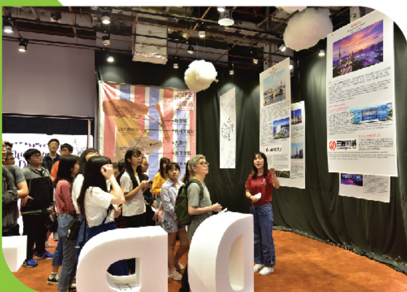
Experience MICE co-ordination works in a MICE lab 於模擬展覽室內體驗會議及展覽籌備工作