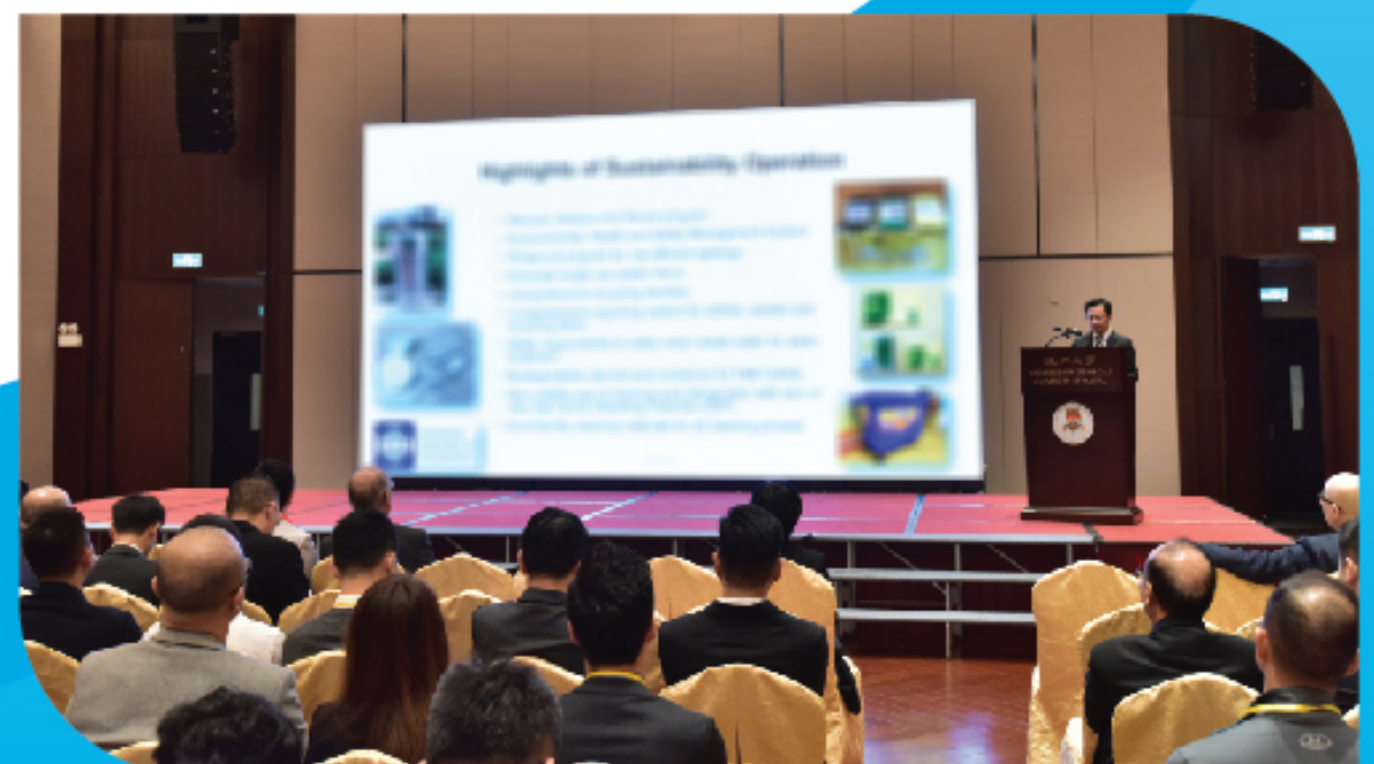
Sharing the sustainable operation practices of an IR 分享一間綜合度假村的可持續營運實務